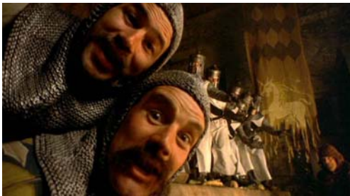
Scene from Monty Python's The Holy Grail . Are they having more fun than we are?